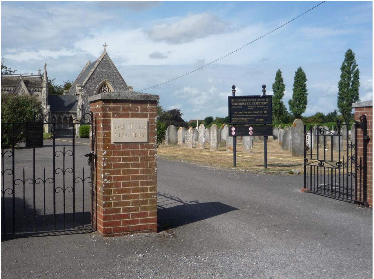
Chichester Cemetery